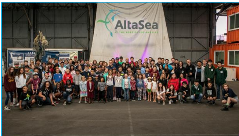
Dr. Bob Ballard (Ocean Exploration Trust) with students at an AltaSea open house.