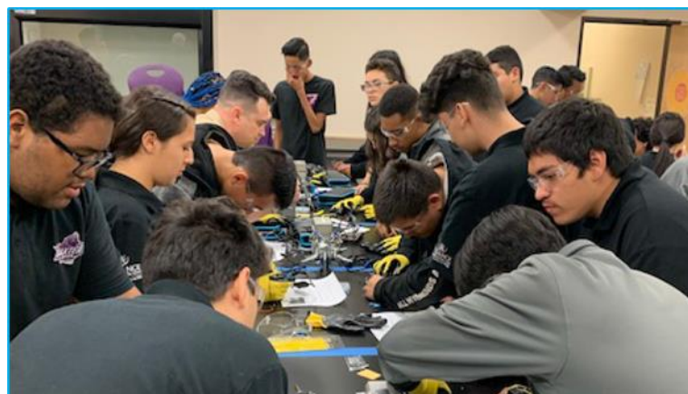
Students at Baxter College Ready High School in San Pedro participate in an AltaSea underwater robotics program.