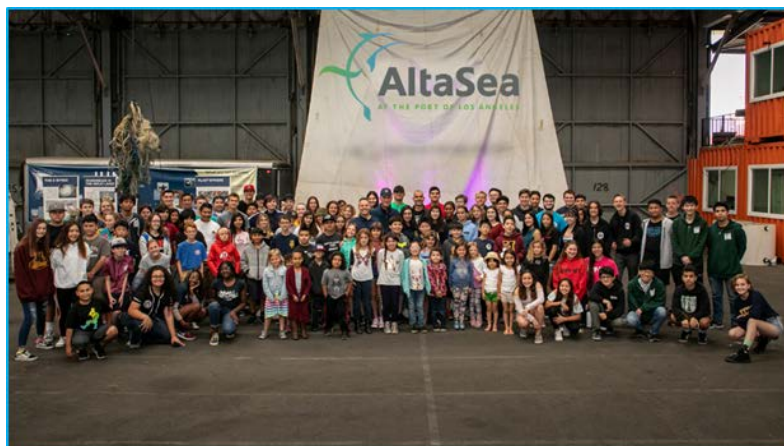
Dr. Bob Ballard (Ocean Exploration Trust) with students at an AltaSea open house.